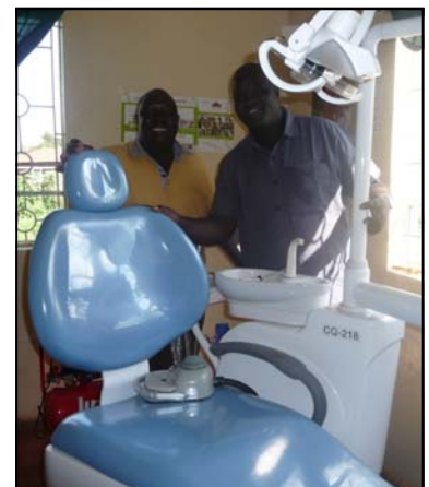
The dental chair at the Kipkaren clinic, bought with funds from the Dental Banquet