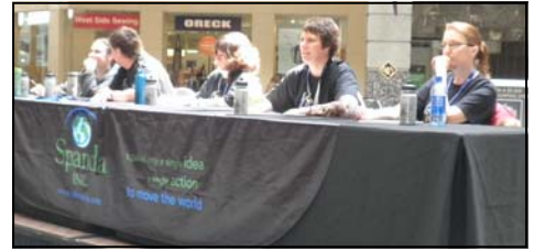
Volunteer Talent Fest judges watch a performance at Westdale Mall.

In early March 2010, Spanda Inc. kicked off Cedar Rapids Talent Fest by attending a Cedar Rapids Show Choir Invitational. Sponsors Mix 96.5 and KCRG TV-9 Show You Care also helped to