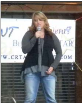
Contestant auditions at Westdale Mall to participate in Finale.

get the word out about this exciting new opportunity. Throughout the spring, talents of varying degrees were invited to six audition days, starting March 27 and ending June 12, at Westdale Mall in Cedar Rapids. The majority of talents were singers, guitar players and dancers; however talents also included karate students, belly dancers and jump ropers. In total 130 individuals or groups participated in the first year of competition.