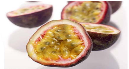
The team will be completing soil testing and analysis for a possible passion fruit farm